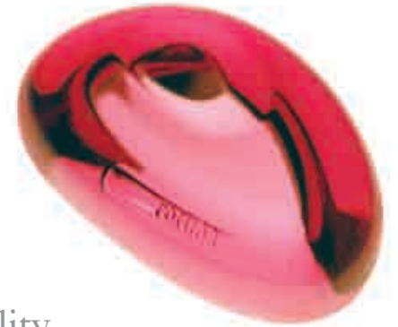
Cellulosic sample 'midi'

Of course an important aspect of scent recognition is its relationship with color - a strawberry scent in a purple color sends the wrong message. In our color lab we can develop custom colors to match any color tone or hue.